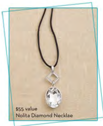
$55 value Nolita Diamond Necklae

2 brand new statement styles earn both of them with sales in June!