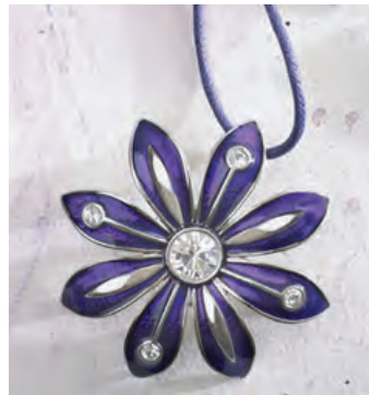
VIOLET BLOOM PENDANT/PIN 2774NF | reg. $49 | sale $34.30