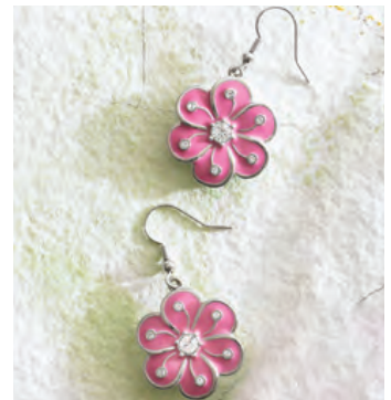
CHERRY BLOSSOM EARRINGS 2779EF | reg. $35 | sale $24.50

*Party must be held and closed between June 1-30 at 11:59 pm PT. Host may participate in the Guest Special with a $100 purchase on full retail items. Guest Special 30% off items apply toward commissionable sales and Host Rewards. Limit ONE discounted item per Guest order.