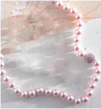
PURELY PINK PEARL NECKLACE 2766NF | reg. $69 | sale $48.30

30% OFF these summer catalog pieces with a $100+ purchase