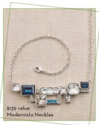
$139 value Modernista Necklae

Coming together is a beginning. Keeping together is progress. Working together is success.