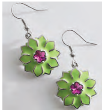
DAHLIA BLOOM EARRINGS 2777EF | reg. $35 | sale $24.50