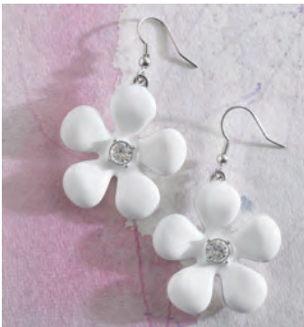
SUMMER WILDFLOWER EARRINGS 2772EF | reg. $59 | sale $41.30