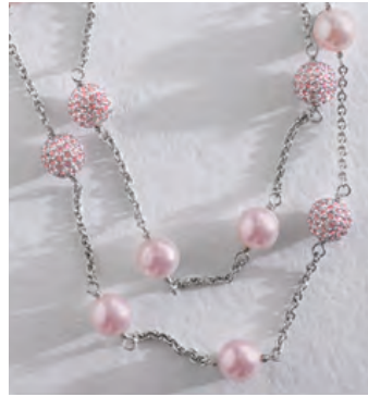
PRETTY IN PINK PEARL NECKLACE 2767NF | reg. $169 | sale $118.30