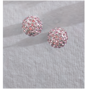
THINK PINK EARRINGS 2769EF | reg. $45 | sale $31.50