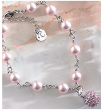
PURELY PINK PEARL BRACELET 2768BF | reg. $55 | sale $38.50