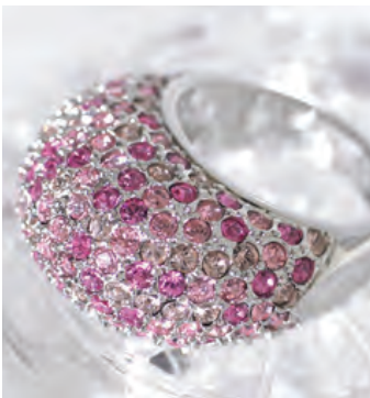
PRICELESS PINK RING 2756RF - sz5 | reg. $85 sale $59.50

2757RF - sz6, 2758RF - sz7 2759RF - sz8, 2760RF - sz9