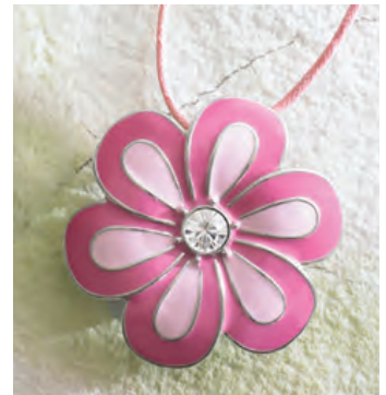
CHERRY BLOSSOM PENDANT/PIN 2776NF | reg. $49 | sale $34.30