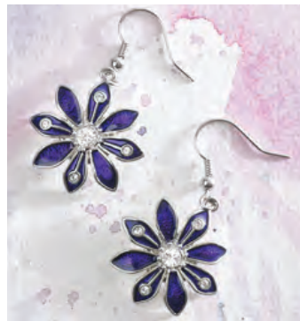
VIOLET BLOOM EARRINGS 2778EF | reg. $35 | sale $24.50

2757RF - sz6, 2758RF - sz7 2759RF - sz8, 2760RF - sz9