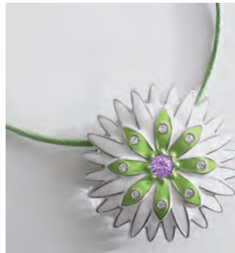
SUMMER DAISY PENDANT/PIN 2775NF | reg. $49 | sale $34.30